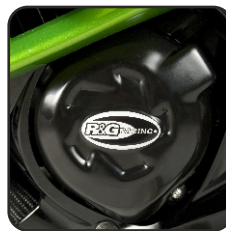
ENGINE CASE COVERS