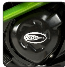
ENGINE CASE COVERS