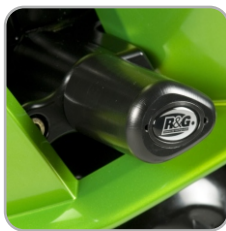
AERO CRASH PROTECTORS