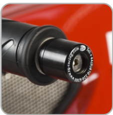
BAR END SLIDERS